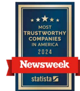
Most Trustworthy Companies in America 2024