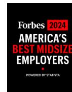
Forbes America's Best Midsize Employers list 2024