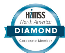
HIMSS Diamond Corporate Member