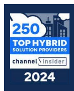
Channel Insider Hybrid Solution Provider 250-2024