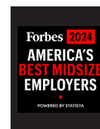
Forbes America's Best Midsize Employers list 2024