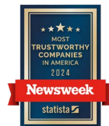
Most Trustworthy Companies in America 2024