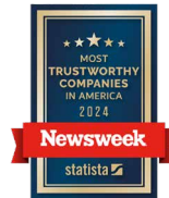
Most Trustworthy Companies in America 2024